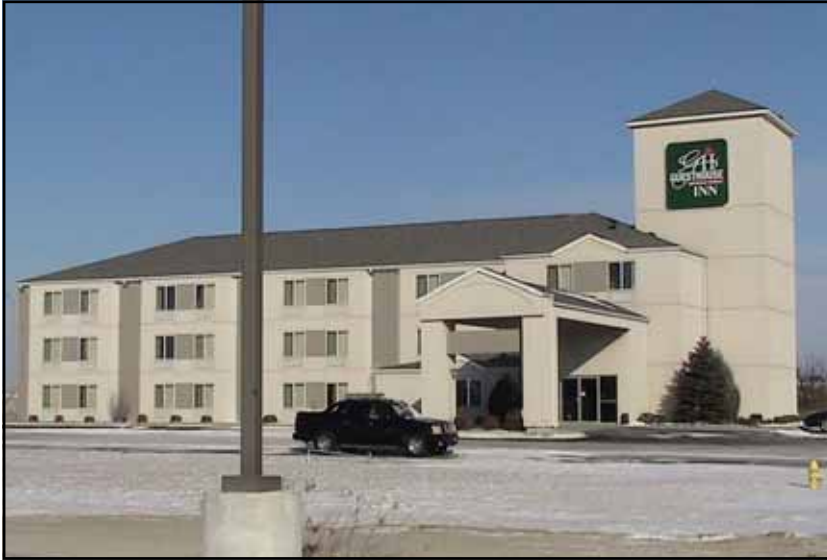
Markle Motel purchased the Guesthouse Inn in Markle with proceeds from the SBA 504 program.