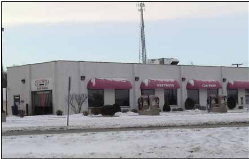
Westwood Carwash purchased a new facility in Auburn with proceeds from the SBA 504 program.