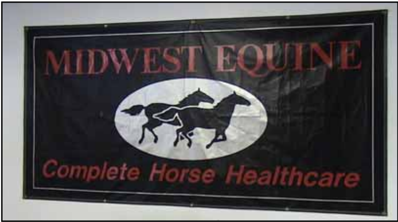
Midwest Equine Veterinary received equipment utilizing the Rural Development Revolving Loan Fund.