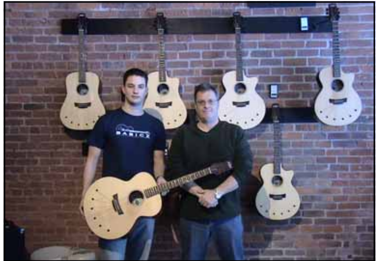
Babicz Guitars received funds from the Industrial Development Revolving Loan Fund for working capital and equipment.