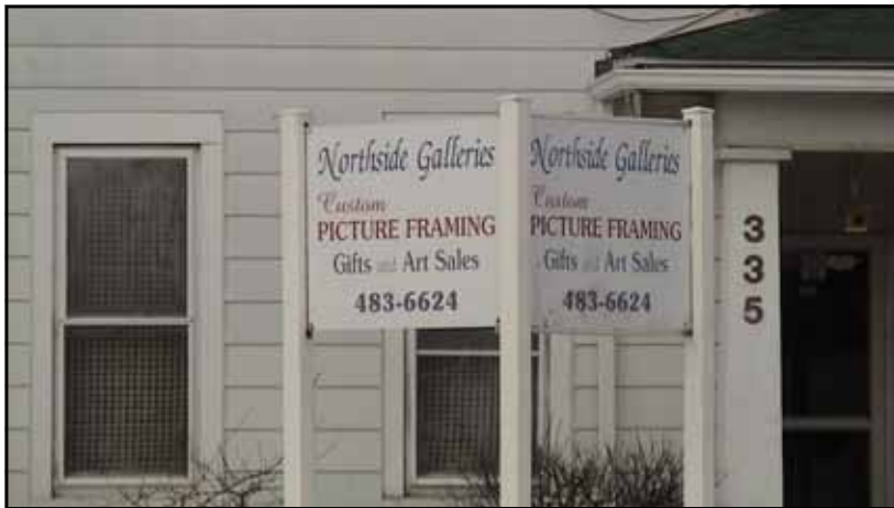
Northside Galleries purchased their building utilizing the Fort Wayne Opportunity Fund.