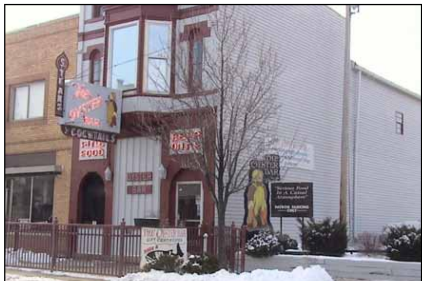
The Oyster Bar received funding for façade and equipment from the Enterprise Zone Revolving Loan Fund.